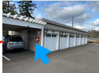
Carport 29 Next to Garage 90