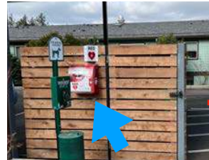
The Oaks Carport