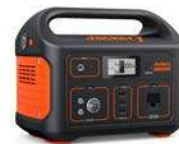
Jackery 240/300/500/1000/1500 WH