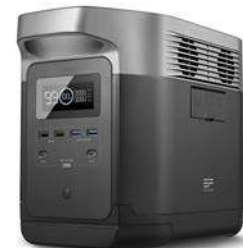
EcoFlow Delta 1300 WH