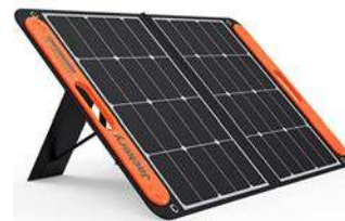
Jackery 60 watt