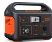
Jackery 240/300/500/1000/1500 WH