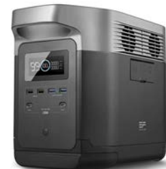
EcoFlow Delta 1300 WH