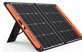
Jackery 60 watt